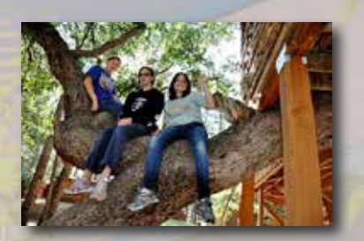
Growing in Faith