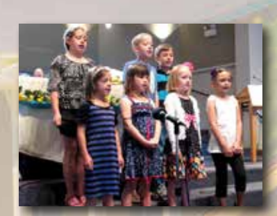
Making a Joyful Noise