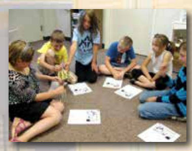
Learning Bible Stories