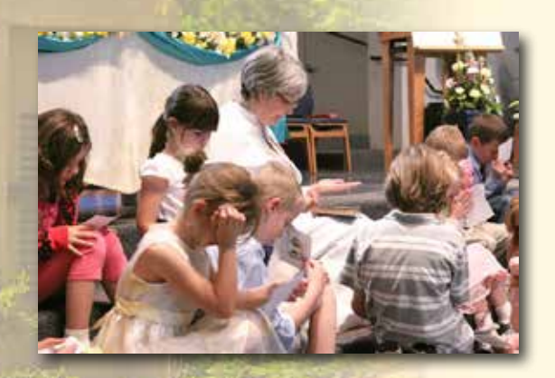
'Making A Difference'